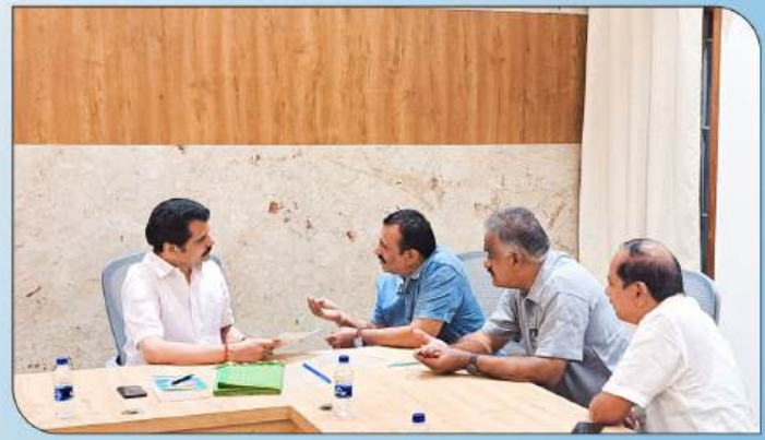
SISPA Office-bearers with the Hon'ble Minister for Electricity, Thiru Senthil Balaji, during a meeting at Coimbatore on 20.11.2024.