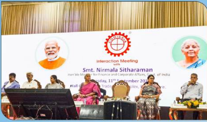
Smt. Nirmala Sitharaman, Hon'ble Union Minister for Finance, along with other dignitaries on the dais during the interactive meeting held on 11.09.2024.