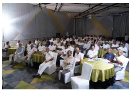
Members at the 33rd AGM of SISPA.