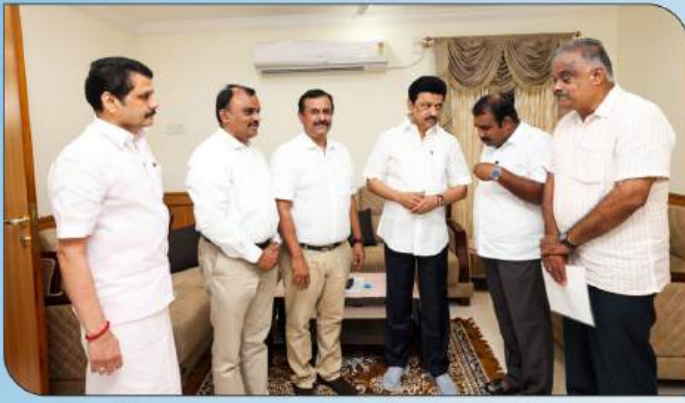
SISPA Office-bearers with the Hon'ble Chief Minister of Tamil Nadu, Thiru M.K. Stalin, during a meeting at Coimbatore on 05.11.2024