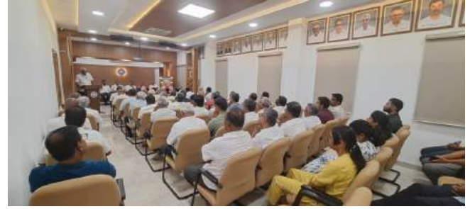
Members fondly remembering his invaluable contributions.