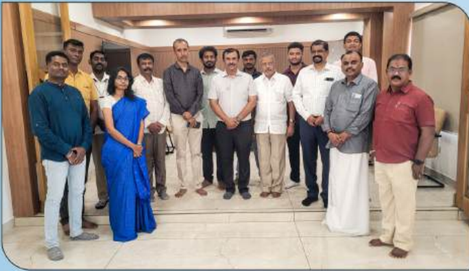
The SISPA team, along with the architect, civil engineer, interior designer, and other agencies, at the 2nd Floor Office opening on 30.08.2024.