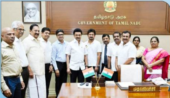
A delegation of textile spinning industry leaders conveying their gratitude to the Hon'ble Chief Minister of Tamil Nadu, Thiru M.K. Stalin, at the Secretariat, Chennai - 16.12.2024.