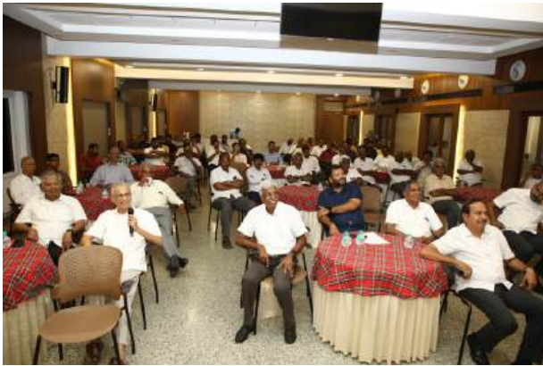
Members interacting with yarn dealers and the CCI General Manager at the meeting.